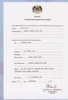
SOLENOID LOCK MALAYSIA CERTIFICATE OF GRANT OF A PATENT MY-111170-A