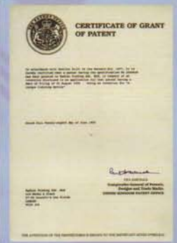
A TORQUE LIMITING DEVICE UNITED KINGDOM CERTIFICATE OF GRANT OF A PATENT (12)U.K. PATENT(19)GB(11)2269428(13)B