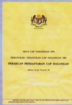
REGISTERED RADION BRAND