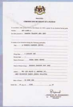
A TORQUE LIMITING DEVICE MALAYSIA CERTIFICATE OF GRANT OF A PATENT MY-110482-A